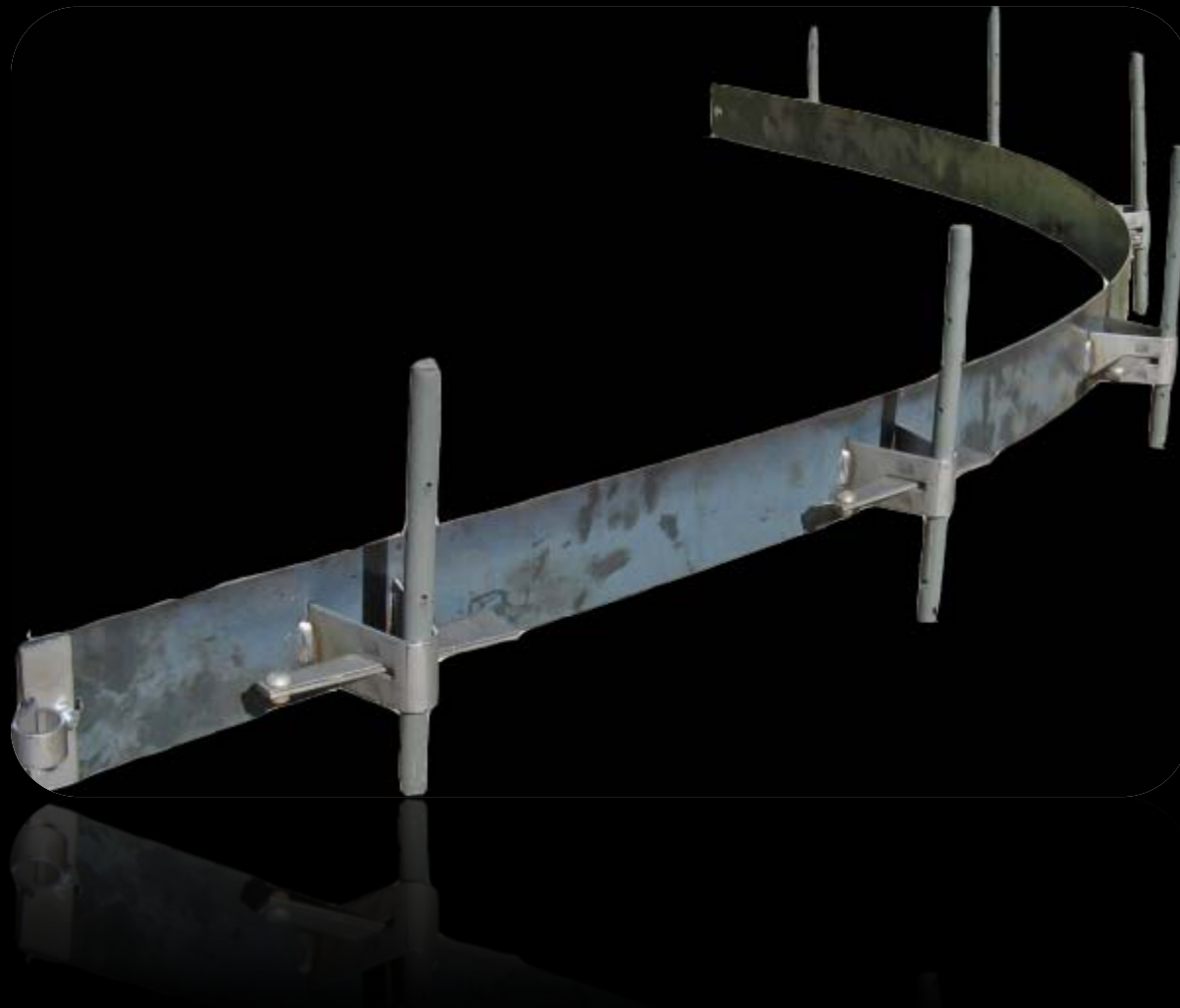
6" steel flexible radius form used for flatwork applications