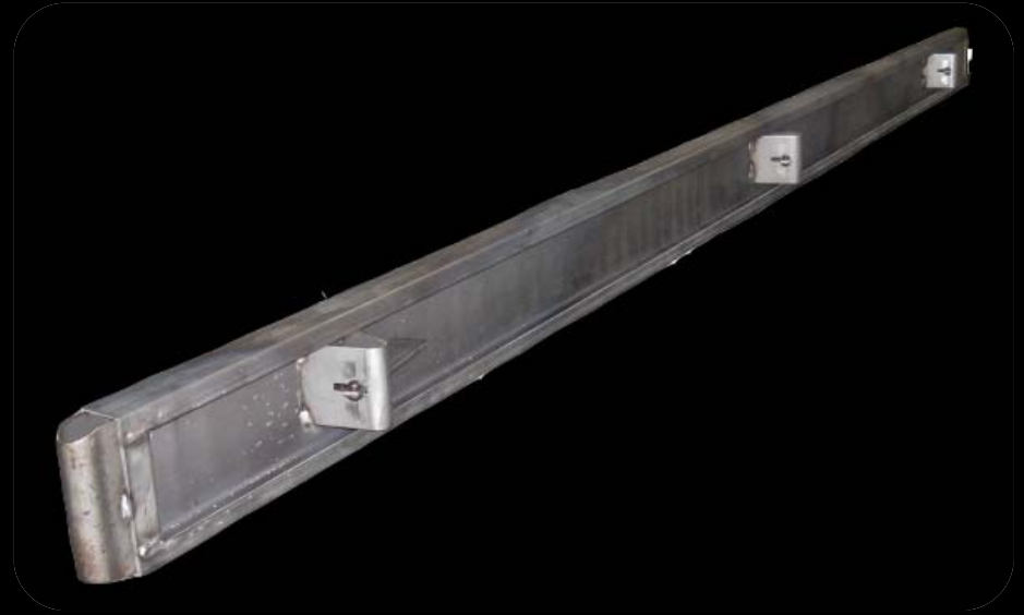
4" Slimline sidewalk form