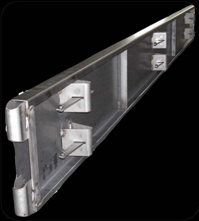
12" Slimline sidewalk form